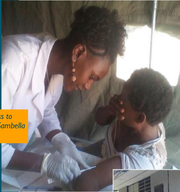
Improving Access to Public Health, Gambella Region