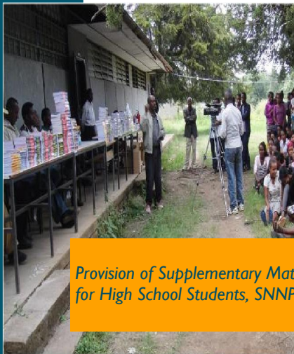
Provision of Supplementary Materials for High School Students, SNNPR