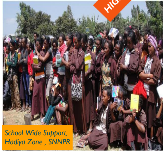
School Wide Support, Hadiya Zone, SNNPR