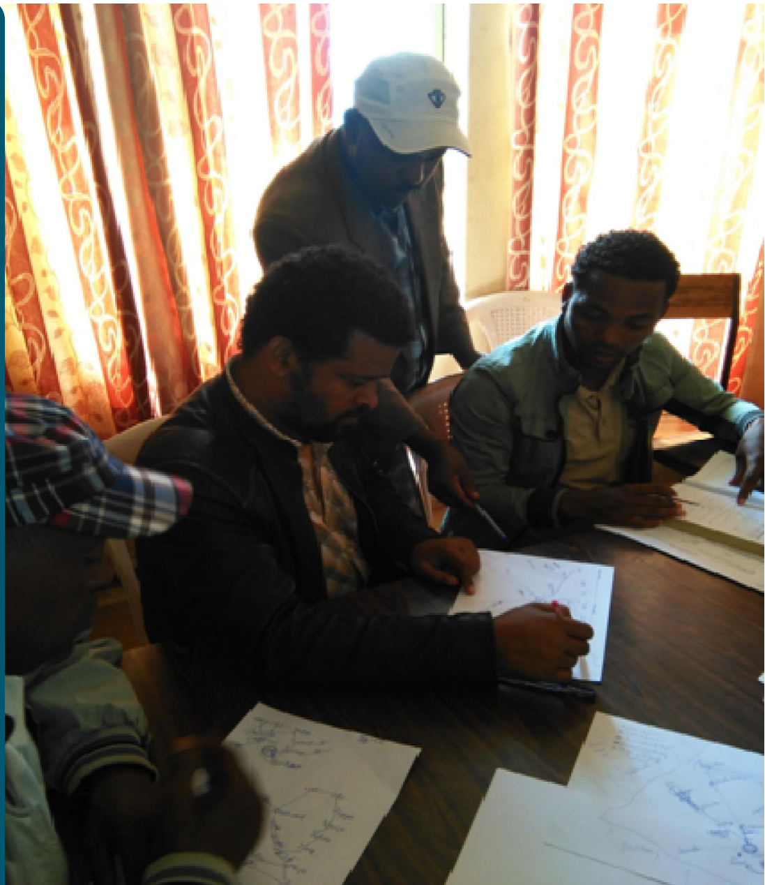
LIAE's staff and representative of community members doing Community Mapping

LIAE implements participatory mapping, which draws on local people's knowledge to explore social problems, opportunities and questions, as an integral part of its project designing, implementation and evaluation.