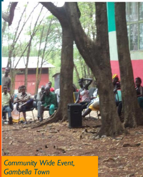
Community Wide Event, Gambella Town