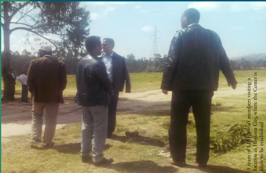
A team of LIAE's staff members visiting a location in Hossana City, where the Center is likely to be established