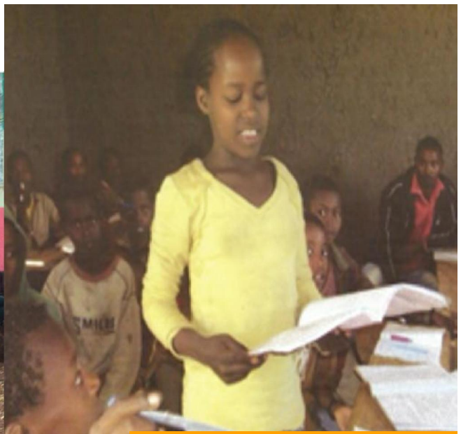
Promoting Girls Education, Hadiya Zone, SNNPR